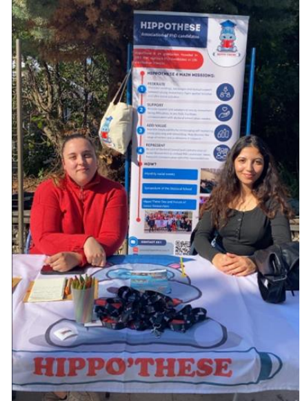
Association Back-to-School fair 16/10/25