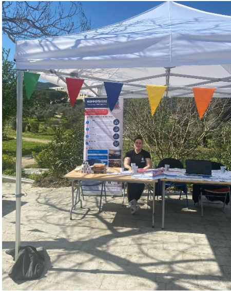
Spring of Associations 27/05/23