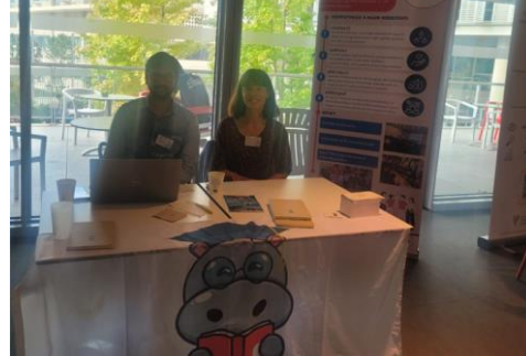
Forum BioTechnoSud 14/10/25