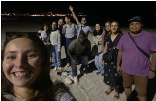
Beach Picnic 12/09/25